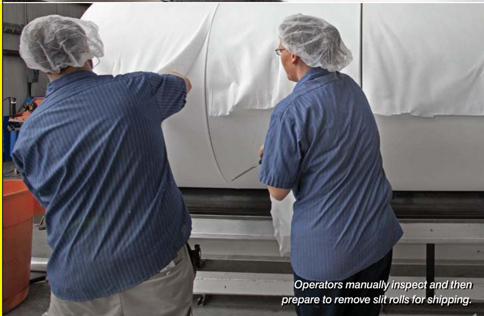
Operators manually inspect and then prepare to remove slit rolls for shipping.